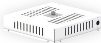
CGLT Cable gland top