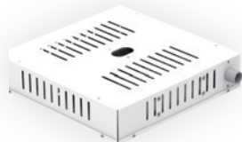
THS Threaded hole side