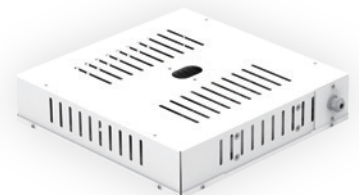
CGLS Cable gland side